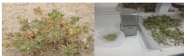
Fig. 1. (A) The Rhazya stricta plant collected from Iranshahr-Khash farms. (B) Leaf samples

The R. stricta plant with herbarium code SH1128256.09FU was collected from Iranshahr-Khash farms (Fig. 1A). Leaves were isolated and washed entirely with water and dried in the open air under natural conditions. Leaf samples (Fig. 1B) were powdered and stored in plastic bottles at room temperature.