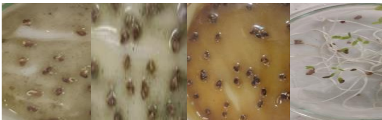
Fig. 3. Illustration of the germination of Cuscuta seeds in Petri dishes containing extracts of R. stricta ; from left to right: Hydroalcoholic extract; Ethanolic extract; Aqueous extract and distilled water (control treatment), respectively.

*Means followed by the same letters in each column are not significant at 1% probability.